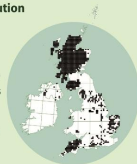
Distribution of Red deer in the UK

Red deer are now widely distributed throughout the British Isles with strongholds in the Scottish Highlands, Lake District, the New Forest, the south west and the east of England.